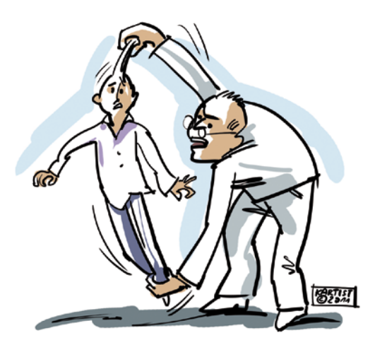
Not so easy to bring up a successor!

reparation for succession starts at an early age. Even before children at school start mentioning (and also comparing) what their parents do for a living, it is important to give children a sense of security and awareness of what it means to grow up in an owning family – all the more if the business is in the public focus and the children bear the same name as the business. In a manner appropriate to the children's age they should be familiarized with the business and its specific features, but without any pressure to follow in their parents' footsteps. Under no circumstances should children be watched too early (at school or while playing) for signs of qualities that might come in useful for a career with the company.